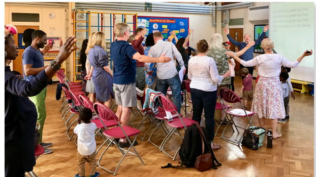
A service in mid-2017

10 years ago, this congregation was 'sent out'. In January 2016, we gathered with our sister congregations from across London at the Institute for Education, Logan Hall. Our yellow-gold balloons festooned the seats we occupied. We were prayed over and commissioned to bring the gospel to Watford and beyond. That happened a whole decade ago. For those of us who've been here from the start, that's hard to believe!