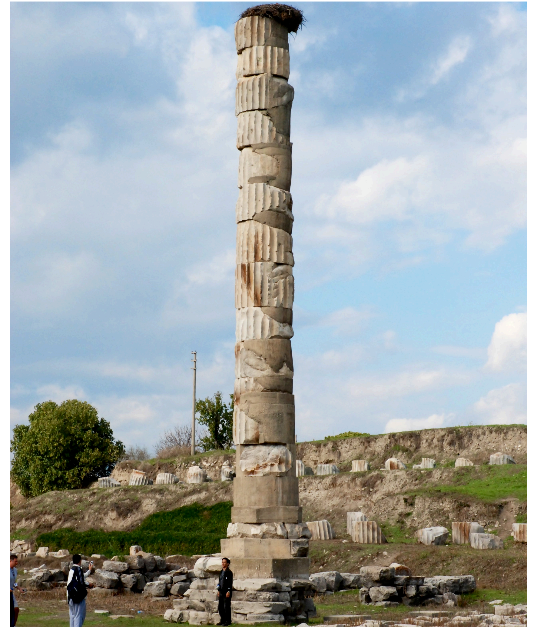
Temple of Artemis today