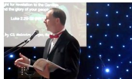
CHRISTMAS SONG A NEW PIECE OF MUSIC

JAN-FEB REPORT; RECENT READING; BOOK REVIEWS; SPEAKING ENGAGEMENTS