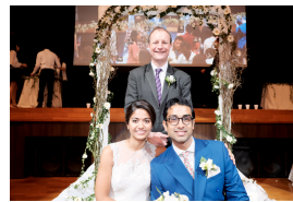
SINGAPORE JOY A WEDDING WITH A DIFFERENCE